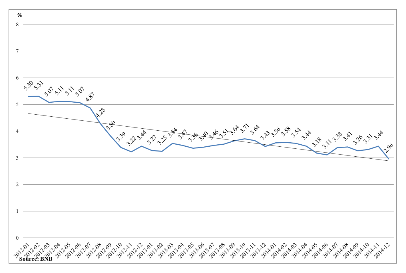
<u>Chart 2: Values of long-term interest rate for the purposes of the assessment of Bulgaria's convergence in the period 2012 – 2014</u>

The external financing received in the period 2012 - 2014 to the amount of BGN 9.44 billion was provided by using various debt instruments, including issues of bonds in the international financial markets, private placement of Schuldschein transferable loans, a bridge loan (Bridge to Bond Loan) and disbursements of already contracted government and government investment loans from international financial institutions.